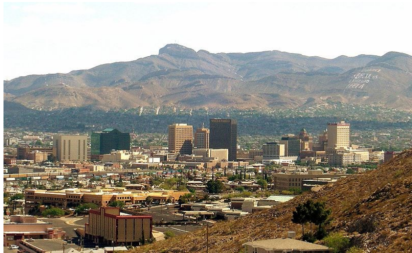
TCHS will meet at the El Paso Convention Center.

After Mass, the TCHS will hold its annual business meeting over lunch in one of the meeting rooms at the cathedral. Our hosts at the cathedral offered a tour of the cathedral as well. Please go to the